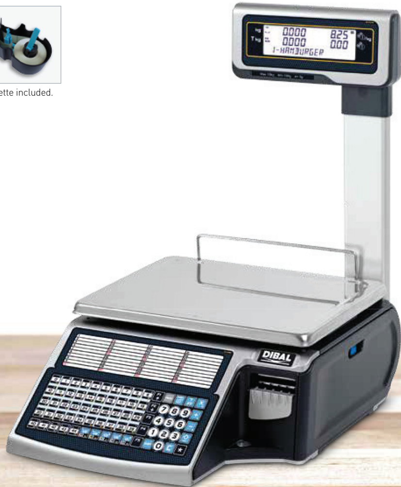
Plate (stainless steel): L360 x W260 mm