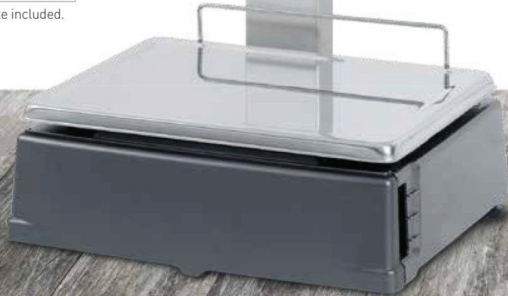
Plate (stainless steel): L360 x W280 mm