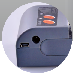
Direct USB Charging(Optional)